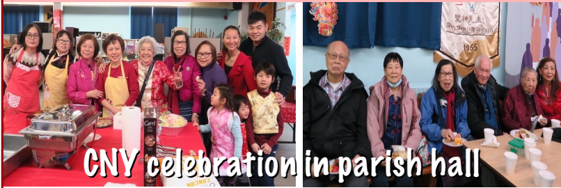
CNY celebration in parish hall