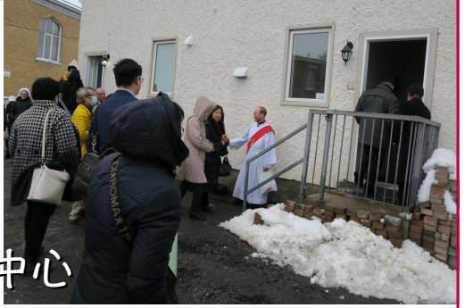
Visit interior of SSPC 參觀牧民中心