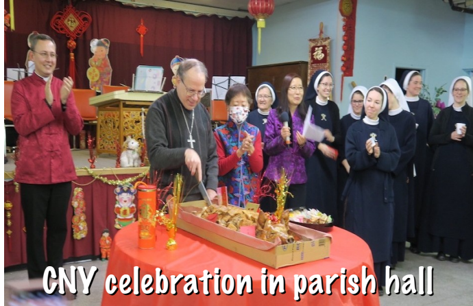
CNY celebration in parish hall