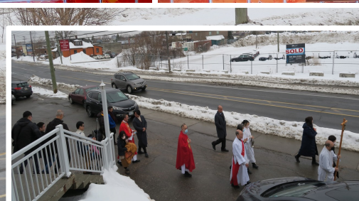
Proceeding to SSPC Ribbon cutting 開幕剪綵