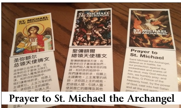
Prayer to St. Michael the Archangel