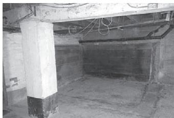
神父宿舍地庫其中引至滋生霉菌的蓄水池已拆除, 視野空曠不少。隨後將會換上可開關的窗門, 讓空氣流通。